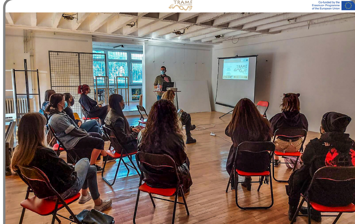
TRAME WORKSHOP AT SCHOOL FOR DESIGN (BELGRADE, SERBIA)

During the past month we prepared a workshop for students of School for design (Belgrade, Serbia) and Liceo Ginnasio Statale “Pilo Albertelli” (Rome, Italy), designed to educate them on the values of cultural heritage, identity and migrations. These values are best exemplified in the story „ The adventure of Zoilos and Annias ”, compiled by the students and professors of the Liceo Ginnasio Statale “Pilo Albertelli” and published by the magazine Archeostorie.