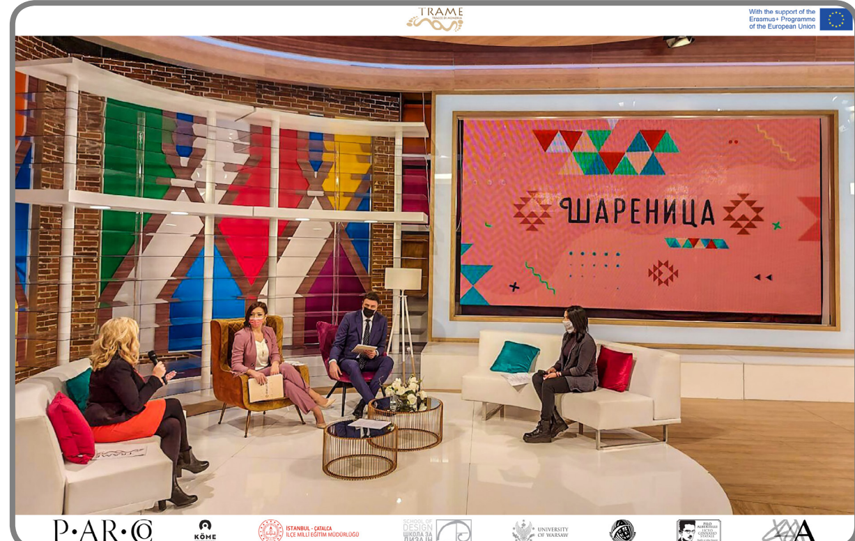
TRAME GUEST APPEARANCE AT ŠARENICA (NATIONAL TELEVISION OF SERBIA)

We would also like to use this opportunity to thank our friends from the media, above all the Original Magazine of the Novak Djokovic Foundation, the Archeostorie Magazine and the Radio Television of Serbia. Thank you for helping us spread the word about TRAME and sharing its values.